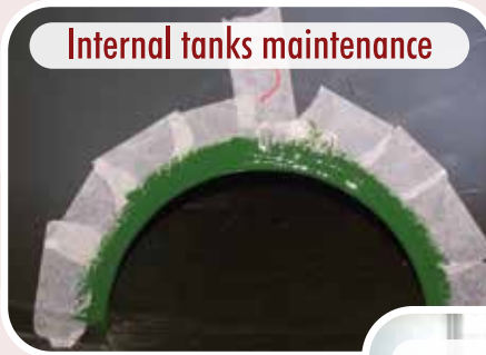
Internal tanks maintenance