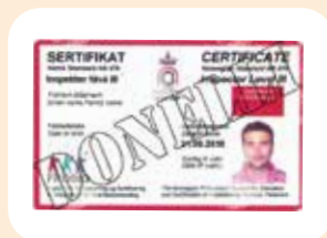
6 FROSIO inspectors