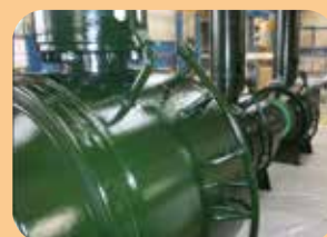
epoxy / polyurethane coatings for buried valves