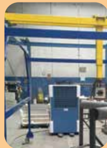
joint R&D projects