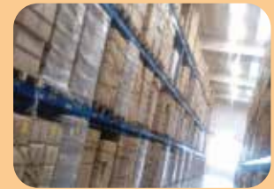
storage & custom services

Packaging in cooperation with Tecno Imballi, dedicated brochure available