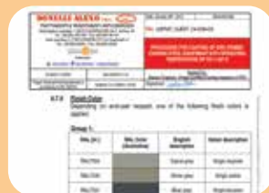
preparation of coating specifications