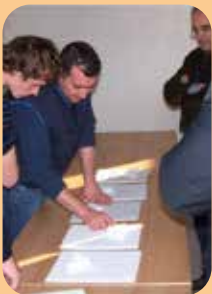
technical training and publications