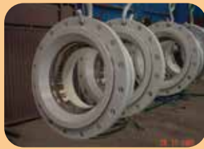
food grade linings