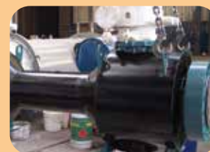
polyurethane coatings for subsea valves