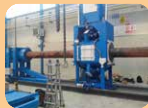
management of clients' coating facilities