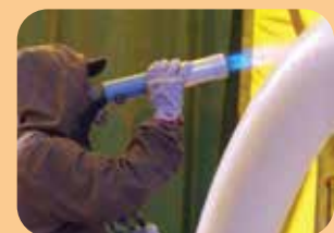
FBE + PP/PE systems