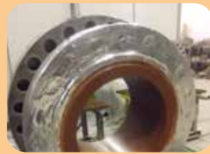
high-temp epoxy-phenolics coatings