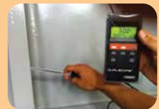
inspection and testing with NACE/FROSIO/CORRODERE inspectors