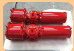
coating of actuators