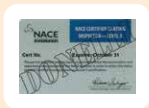
12 NACE inspectors