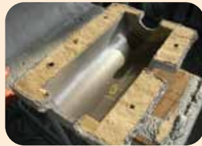
pre-cast fire proofing protection