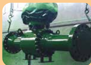
epoxy coatings for subsea valves