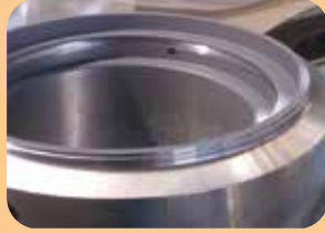
heat - curing coatings