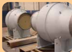
metallization (TSA, TSZ)