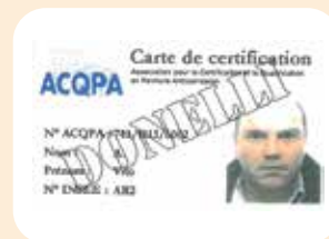
35 ACQPA applicators