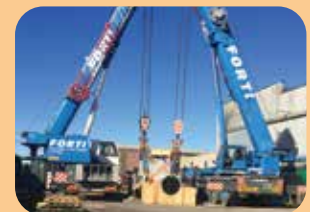
handling of pieces with weight up to 150 tons