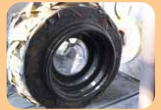
FBE (Fusion Bounded Epoxy)