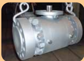
silicone based coating