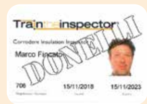
1 CORRODERE insulation inspector