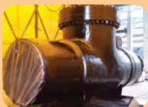
polyurethane coatings for buried valves