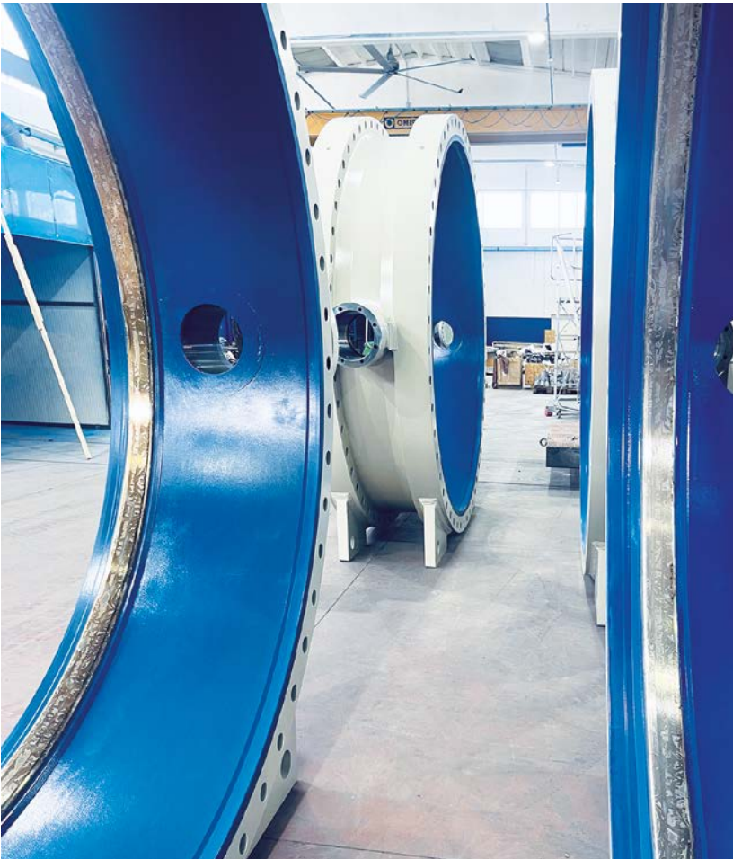
The lining of a valve’s inner surface with FBE powder.