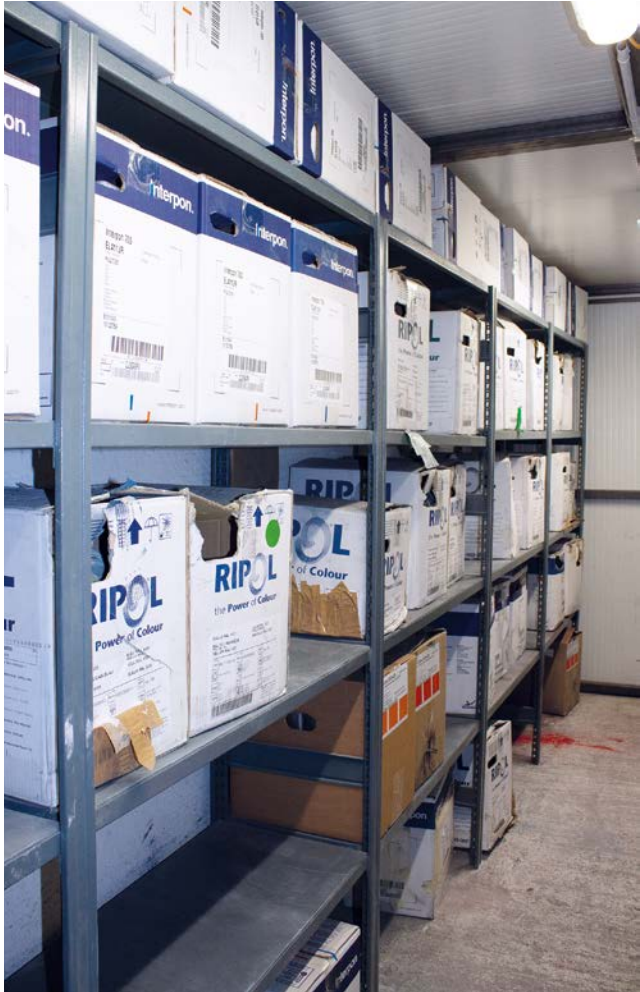
Powder coating products are stored in a dedicated temperature-controlled warehouse.

IN ADDITION TO INCREASED SUSTAINABILITY, POWDER COATINGS OFFER MANY ADVANTAGES. THEIR DURABILITY IS REMARKABLE, REDUCING THE NEED FOR FREQUENT MAINTENANCE AND ITS RELATED COSTS AND EXTENDING THE SERVICE LIFE OF EQUIPMENT AND INFRASTRUCTURE. IN ADDITION, THEY CAN BE APPLIED ELECTROSTATICALLY AND IN FLUIDISED BEDS, ENABLING TO COAT EVEN THE MOST DIFFICULT-TO-REACH SURFACE AREAS.