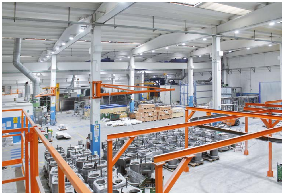
Overview of Donelli Alexo MXP's coating department.

In the petrochemical industry, valves play a key role in the extraction, transport, and refining of fluids because they ensure a safe and efficient flow. However, they are often exposed to harsh environmental conditions and aggressive corrosive agents. Such constant exposure can seriously compromise their structural and operational integrity, putting plant safety at risk and generating malfunctions that can cause costly and potentially dangerous operational interruptions. Corrosion protection is, therefore, a crucial factor that can never be underestimated as it is closely linked to the longevity and reliability of infrastructure.