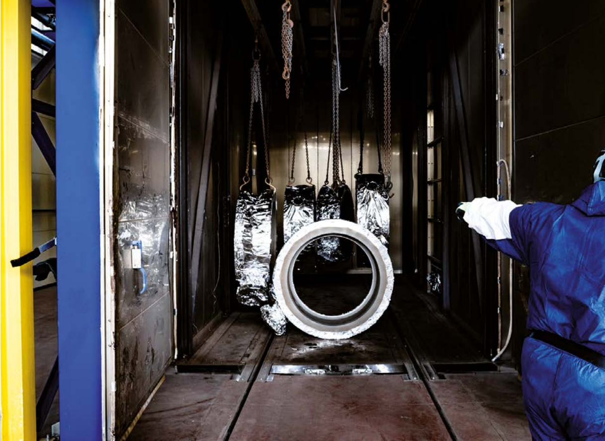
The inside of the curing oven.

“At the end of the sandblasting process – using abrasives in different types and with different grain sizes depending on the surfaces to be treated and the specifications of the customer’s technical data sheets – we proceed with lining the inside of the valves by applying the Scotchkote™ FBE epoxy powder coating,” explains Alessio Trisolino.