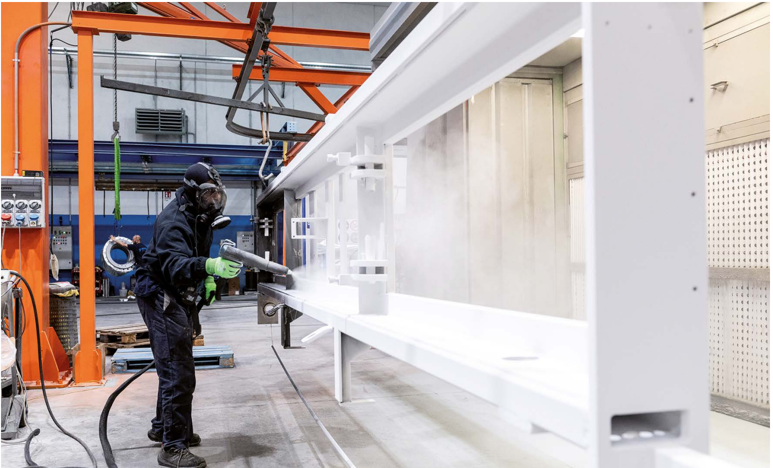
One of the areas devoted to the application of powder coatings.