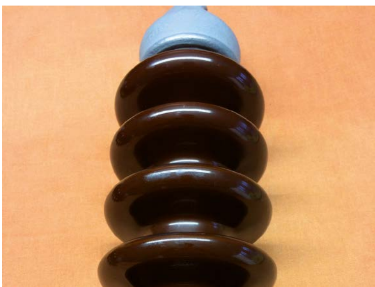
A high-voltage porcelain insulator thoroughly cleaned with the SÄKA 80.750 cleaning paste and sealed with the SÄKA 81.750 silicone grease.

This product can be applied with a soft brush or cloth to an approximate thickness of 0.3 mm (300 microns) and fully polished until the surface is non-stick and almost shiny, at operating temperatures ranging from -40 to +200 °C. As with the other products in this range, SÄKA 81.750 is solvent-free and contains physiologically harmless greases. Therefore, it is non-hazardous, and no special equipment or extensive personal protection equipment (PPE) is needed during its application process.