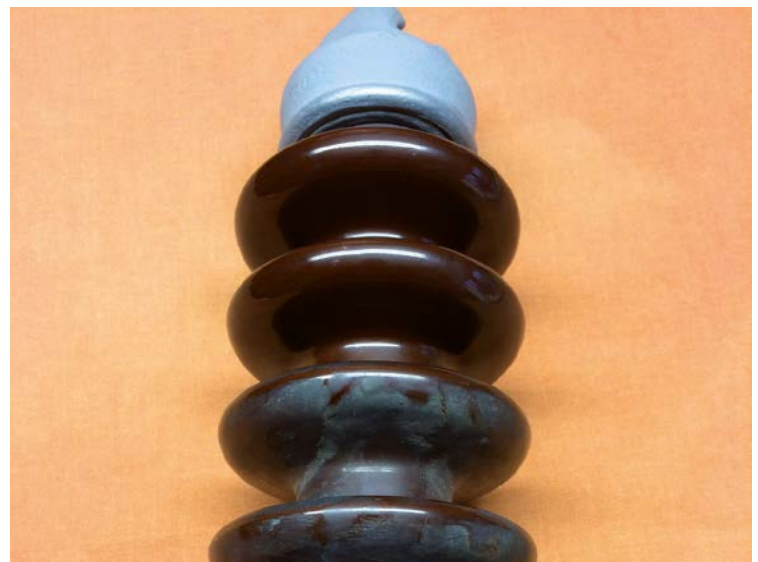
A high-voltage porcelain insulator partially treated with the SÄKA 80.750 cleaning paste.